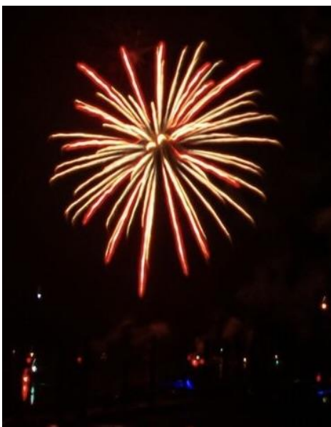
Todd Mason, from BHA Facebook

The future of the July 3 rd Fireworks is in our community's hands. The original intent for the fireworks was to create one large central display to replace the individual street fireworks and the noise and fire danger that came with them. While it didn't eliminate people shooting off their own fireworks, it did significantly reduce it.