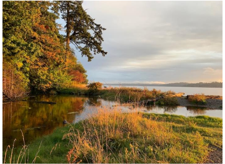
Burfoot Park estuary.