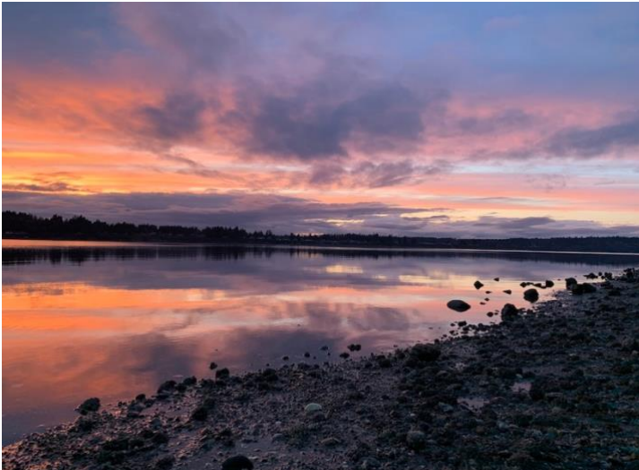
Burfoot Beach at sunset. Kim Kelley